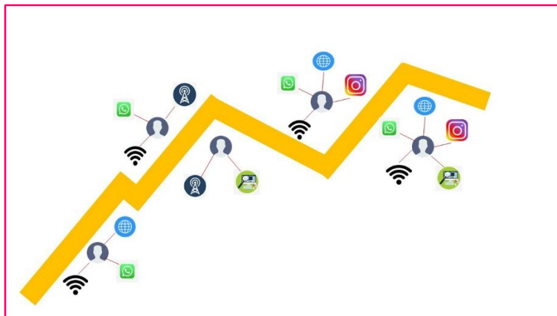
Figure: 1.1 Internet Inequity

Many of the institutions like top research centre take the initiatives to rectify the internet inequity. In the internet inequity desperate the people in the technology retrieval of data. Most of the online resources regarding in the Tamil language may give more complex. Even the researcher may have more interest to get the truthful information in their own language but for the Tamil language sites doesn't give much impact. Accessible on the information among the internet is meant inequality due to the digital divide. Technological impact is also one of the reasons for the internet inequity among people[3]. The disparity in the internet sources in the regional language is reduced due to the less research interest on the languages and arts. The divide is taken in the technology and the sources of the information. The sources are very less in the regional language and also the network is also less for the regional language research based on the equal internet.